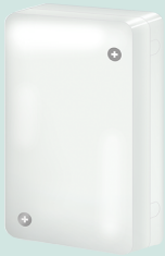
CZ-CAPRA1 RAC interface adapter for integration into P Link