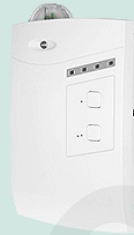
PAW-SMSCONTROL. Control by SMS (need additional SIM card).