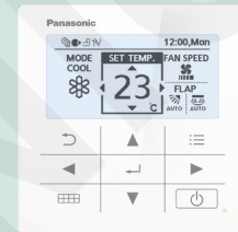
CZ-RD517C. Wired remote controller for wall-mounted and floor console