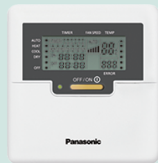
Wired Remote Control CZ-RD514C